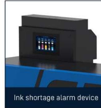
Ink shortage alarm device