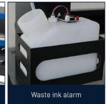
Waste ink alarm