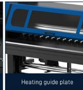
Heating guide plate