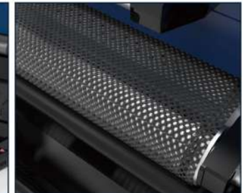
Conveyor belt, special power control structure