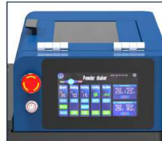
Touch smart control panel