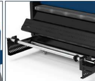
Dual power paper feeder