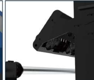
Air cooling fans