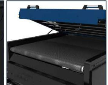
Upper drying curing