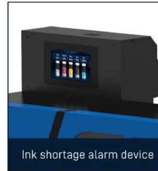
Ink shortage alarm device