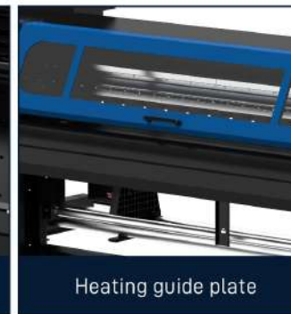
Heating guide plate