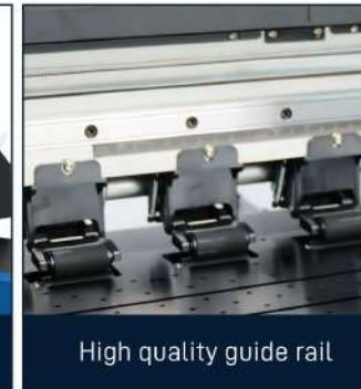
High quality guide rail